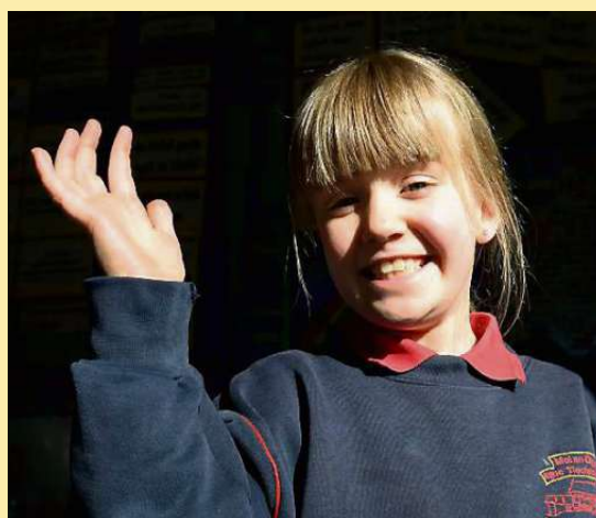
Tuathlaith in the classroom at Gurraneasig NS.